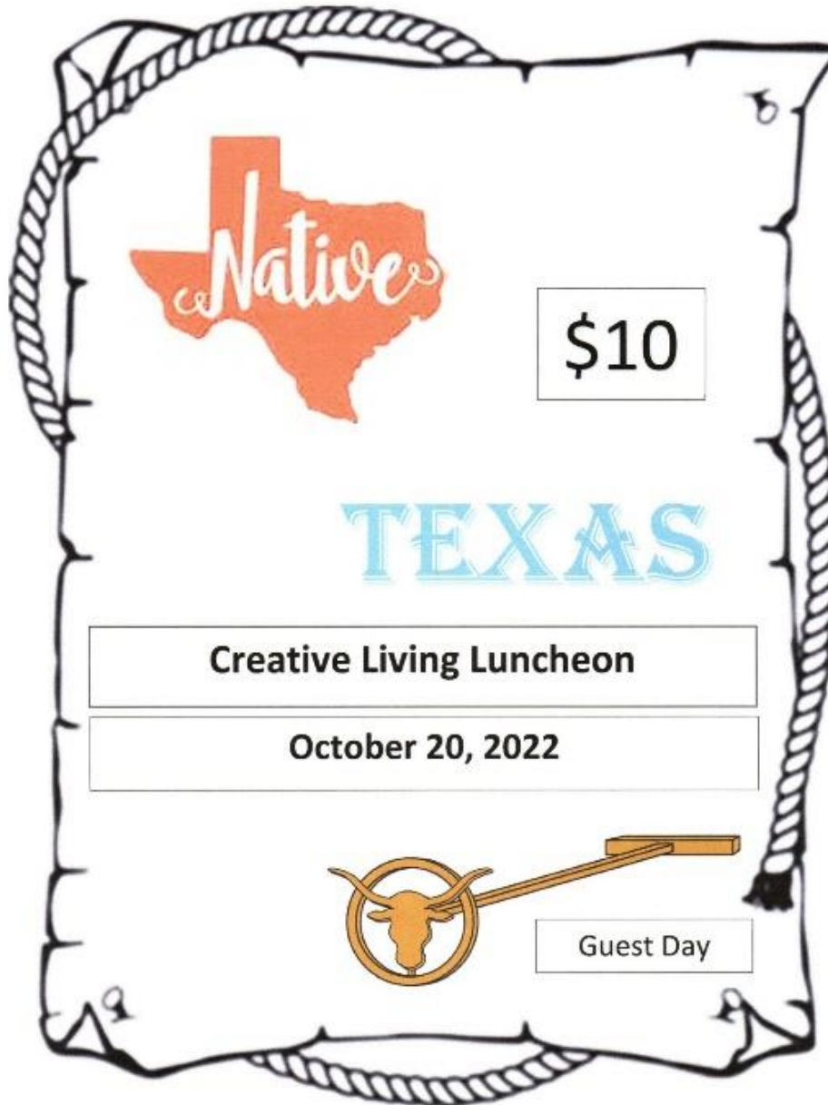
Photo presentation and history of native Texas food brands.

Luncheon – sampling of native Texas foods.